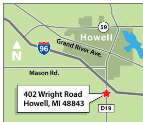
Livingston County Center (LIVCEN)

Visit the LCC locations webpage for more information.