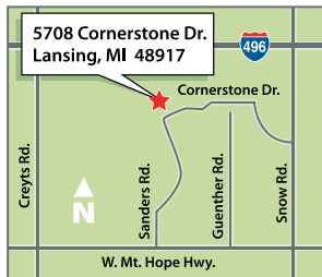
West Campus (WCB)