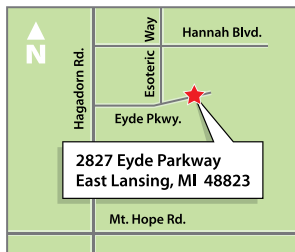
LCC East (EAST)