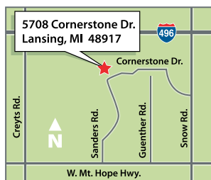
West Campus (WCB)