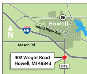
Livingston County Center (LIVCEN)